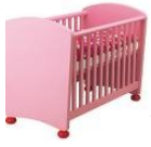
the baby bed